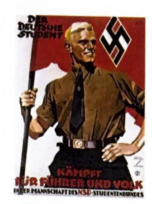
This 1930s Nazi poster reads "The German student fights for the Führer and the people." What message does this poster send?

In the final months of 1941, the oys stepped up their resistance. hey became more confident and ore daring, churning out more