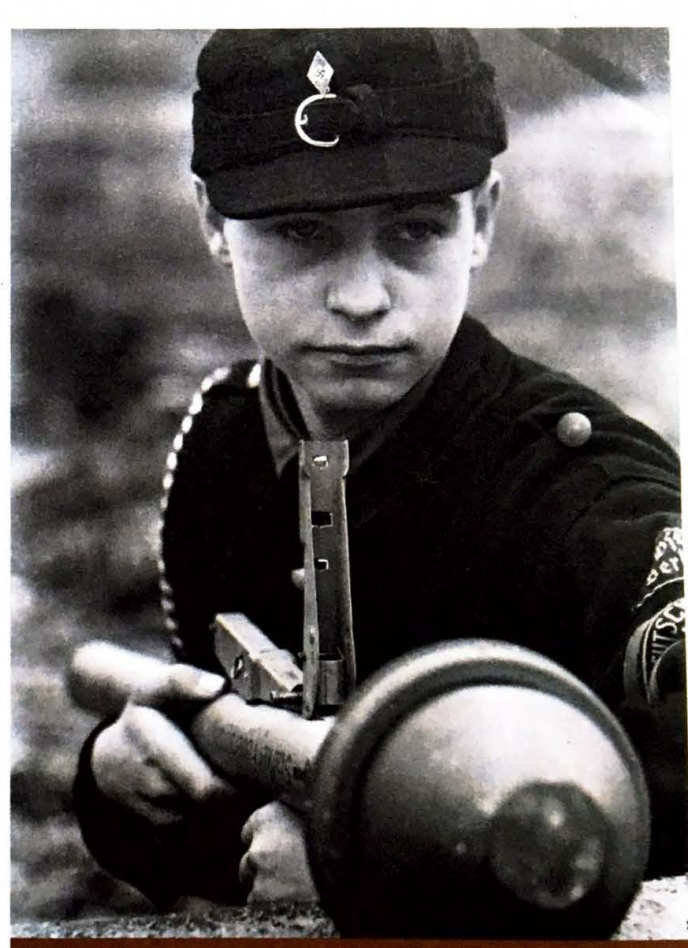
In the Hitler Youth, boys received military training and fought mock battles. They were being trained as future Nazi leaders.